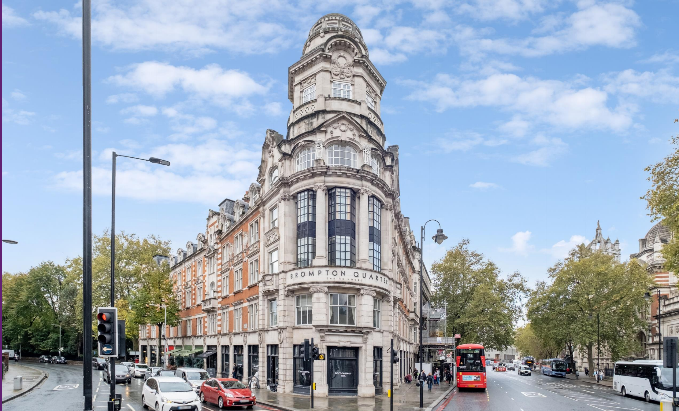
Empire House Thurloe Place, SW7