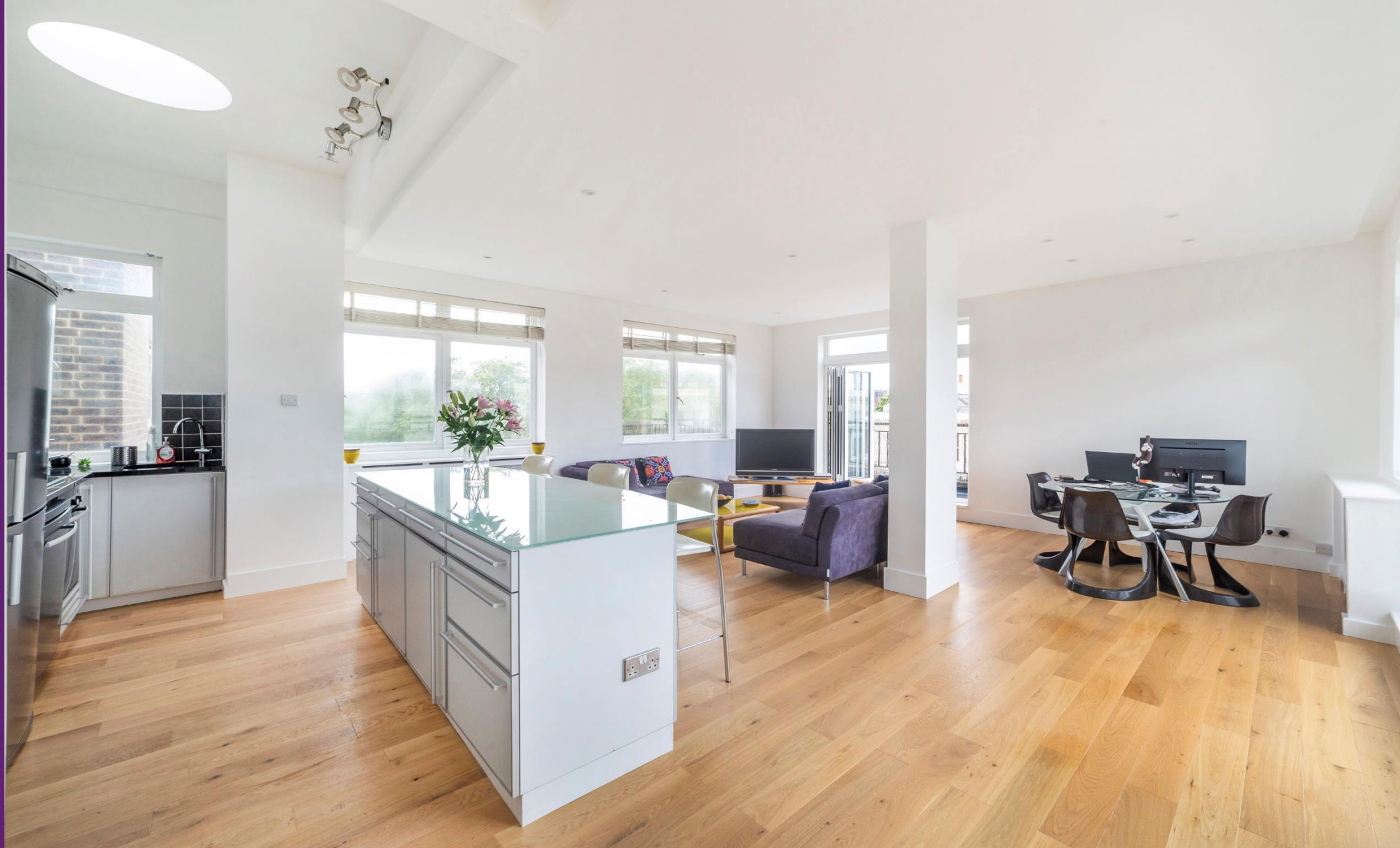
Derwent House Stanhope Gardens, SW7