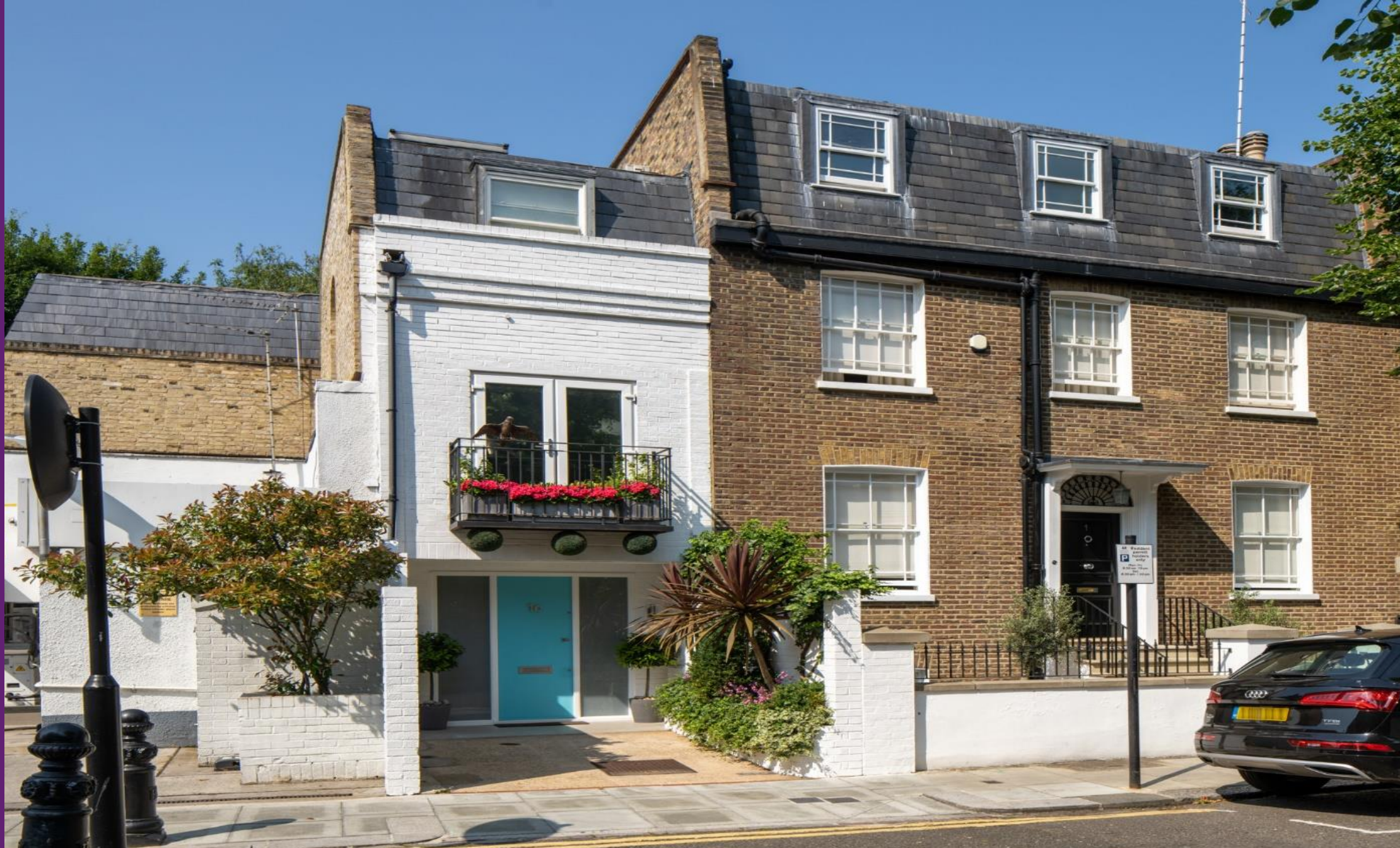
The Studio Clareville Grove, SW7