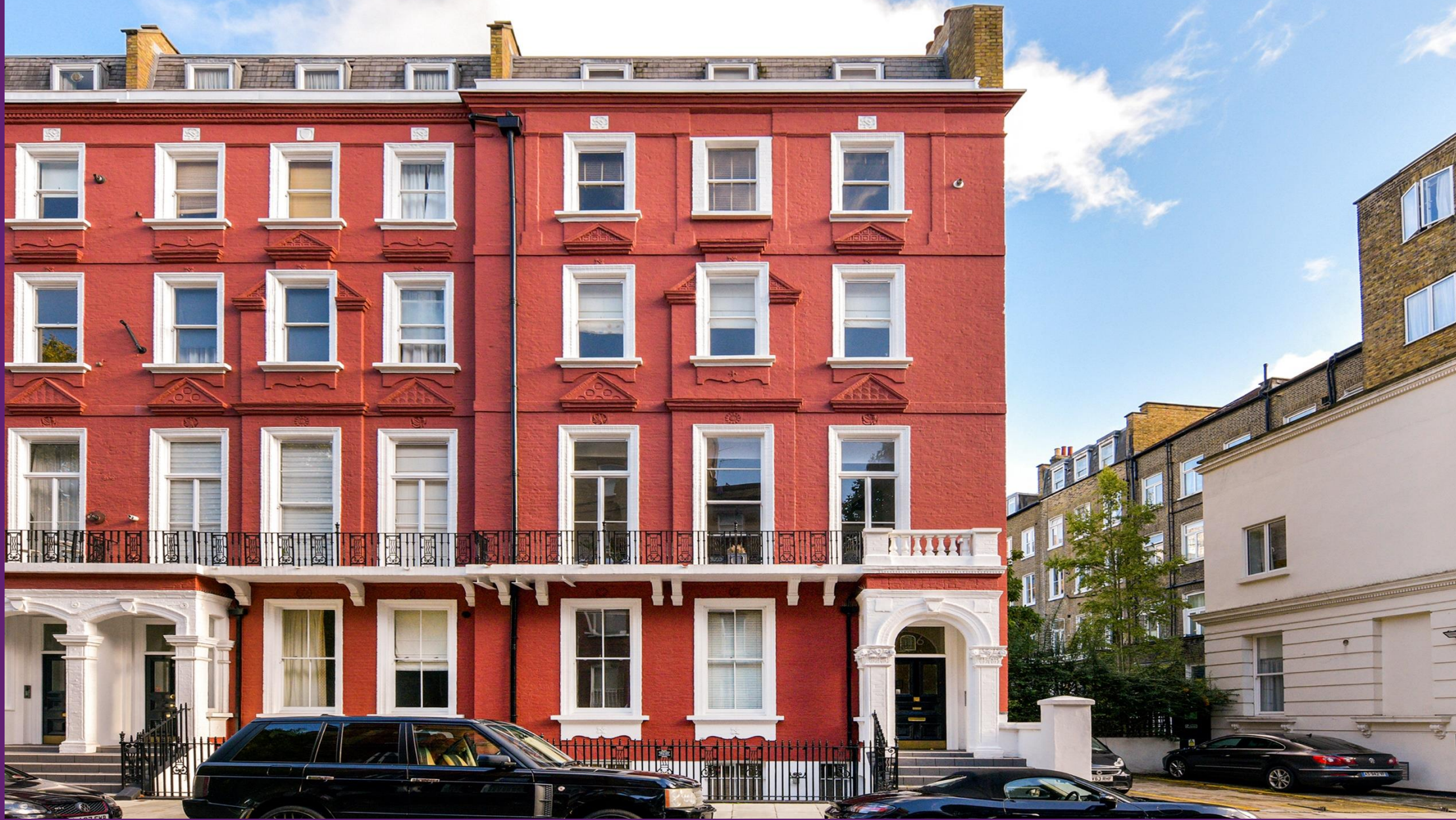
Nevern Square London, SW5