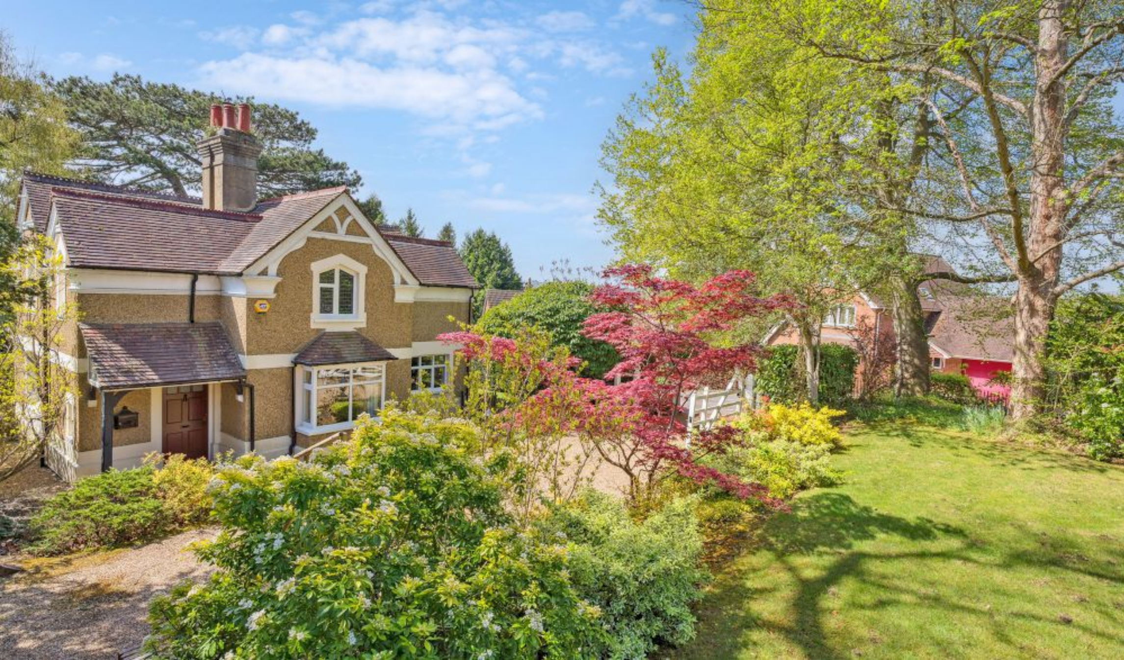
Millfield Lodge Gravel Path | Berkhamsted | Hertfordshire