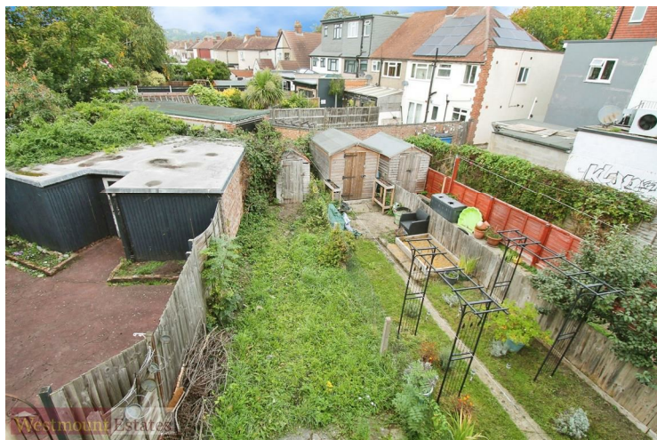
Private section of garden to the rear of the property.