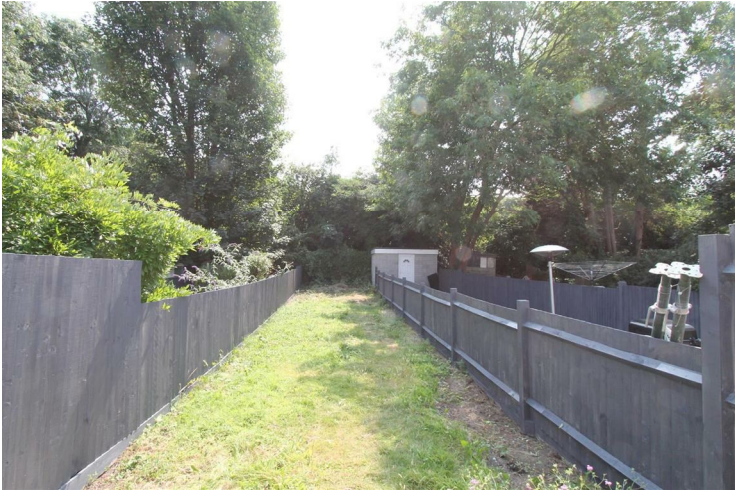
A private rear garden which is mainly laid to lawn with its own access via a lockable gate.