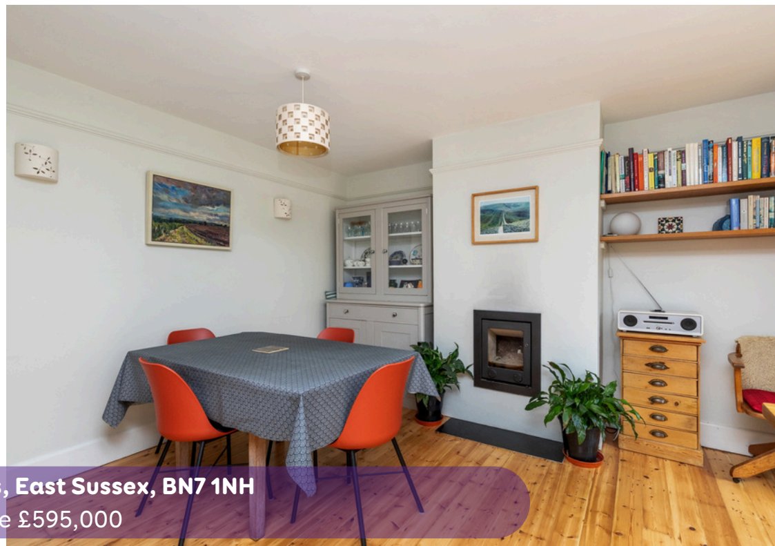
18 Middle Way, Lewes, East Sussex, BN7 1NH Asking Price £595,000