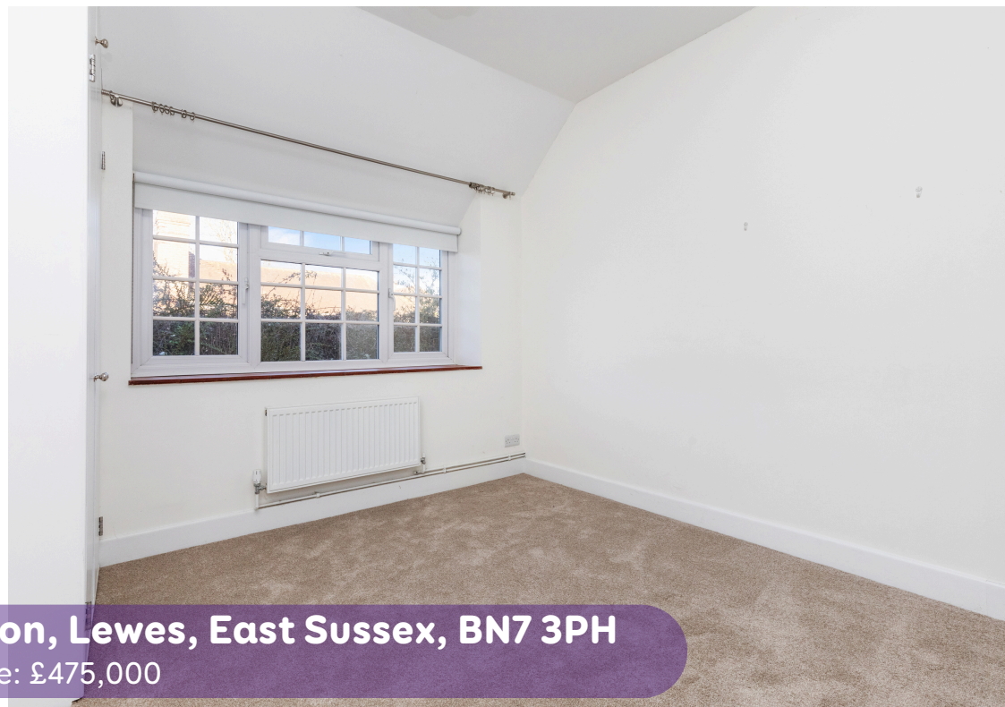
Flint Cottage, Barn Close, Kingston, Lewes, East Sussex, BN7 3PH