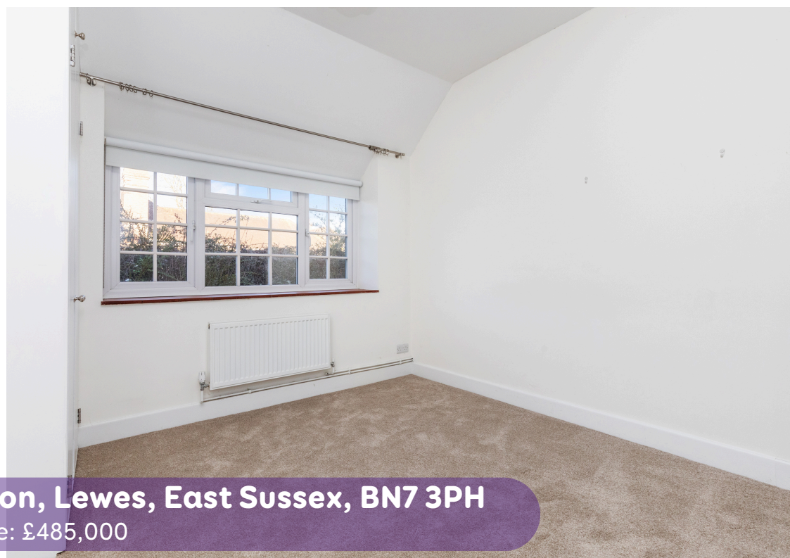
Flint Cottage, Barn Close, Kingston, Lewes, East Sussex, BN7 3PH