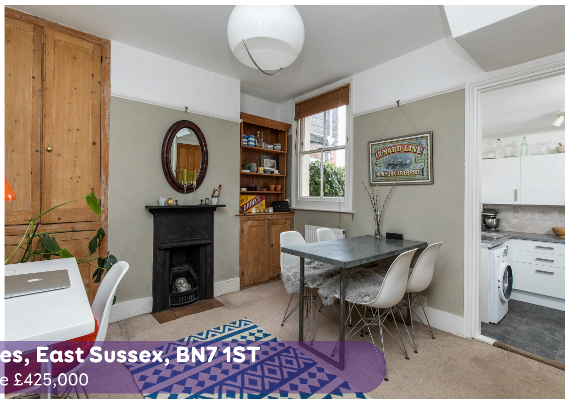
85 De Montfort Road, Lewes, East Sussex, BN7 1ST Asking Price £425,000