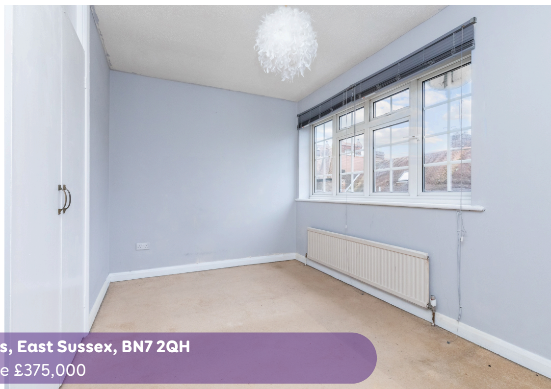
8 Edward Street, Lewes, East Sussex, BN7 2QH Asking Price £375,000