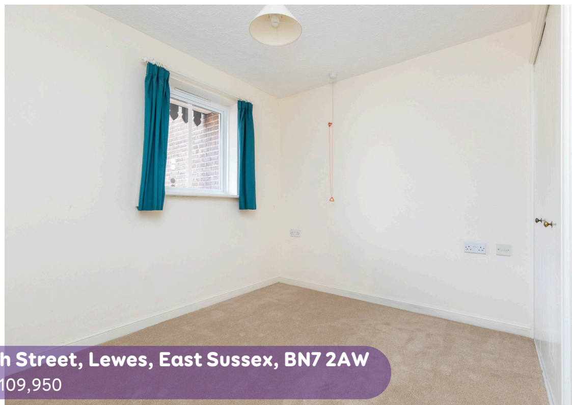
Flat 14, St. Thomas Court, Cliffe High Street, Lewes, East Sussex, BN7 2AW Price: £109,950