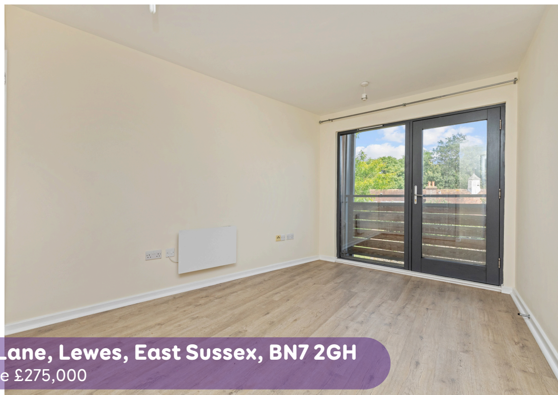
Flat 11, The Printworks, St. Nicholas Lane, Lewes, East Sussex, BN7 2GH Asking Price £275,000