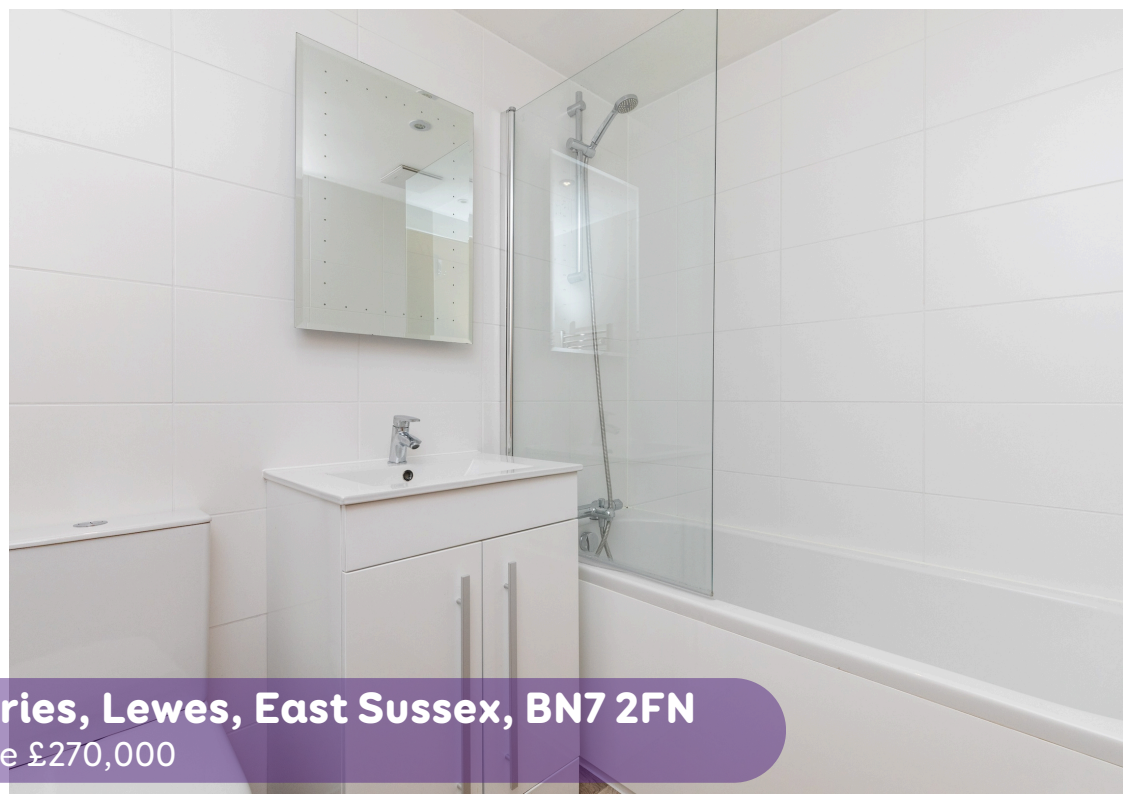
Flat 21, Clayhill Court, 20 The Nurseries, Lewes, East Sussex, BN7 2FN Asking Price £270,000