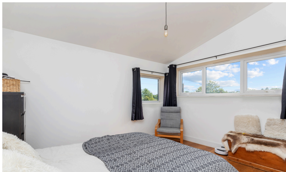
24 Timberyard Lane, Lewes, East Sussex, BN7 2AU Asking Price £1,350,000