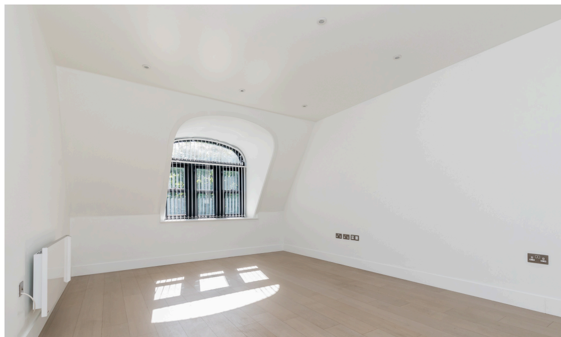
The Friars, Friars Walk, Lewes, East Sussex, BN7 2LG Asking Price £365,000