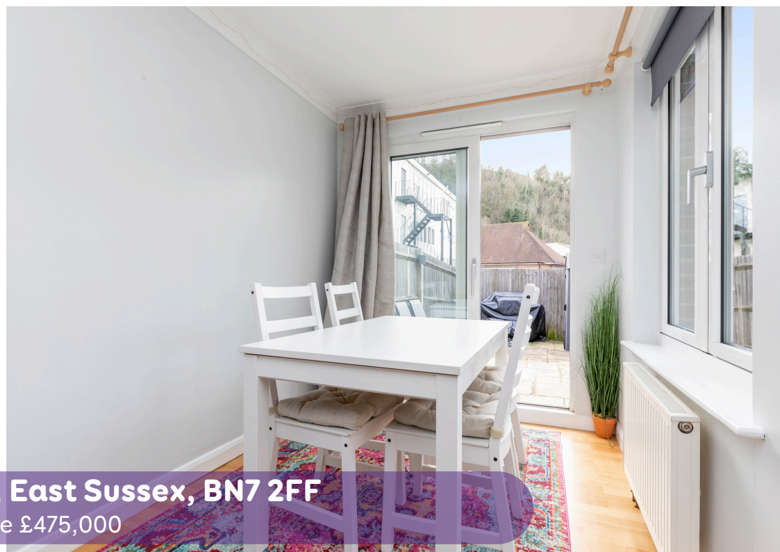
The Nurseries, Lewes, East Sussex, BN7 2FF Asking Price £475,000