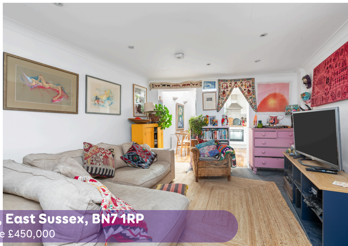
Western Road, Lewes, East Sussex, BN7 1RP Asking Price £450,000