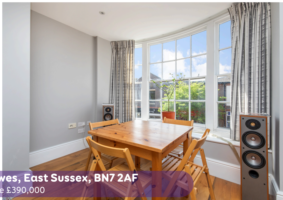
Flat 1 220 High Street, Lewes, East Sussex, BN7 2AF Asking Price £390,000