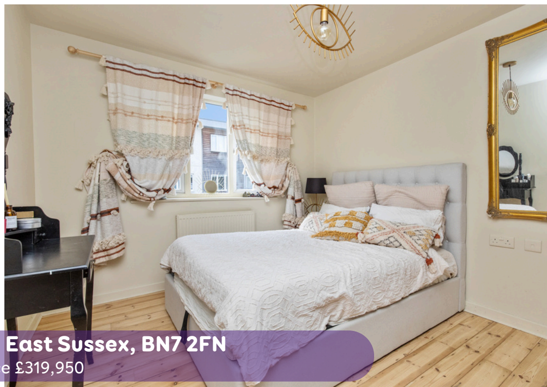
Clayhill Court, Lewes, East Sussex, BN7 2FN Asking Price £319,950