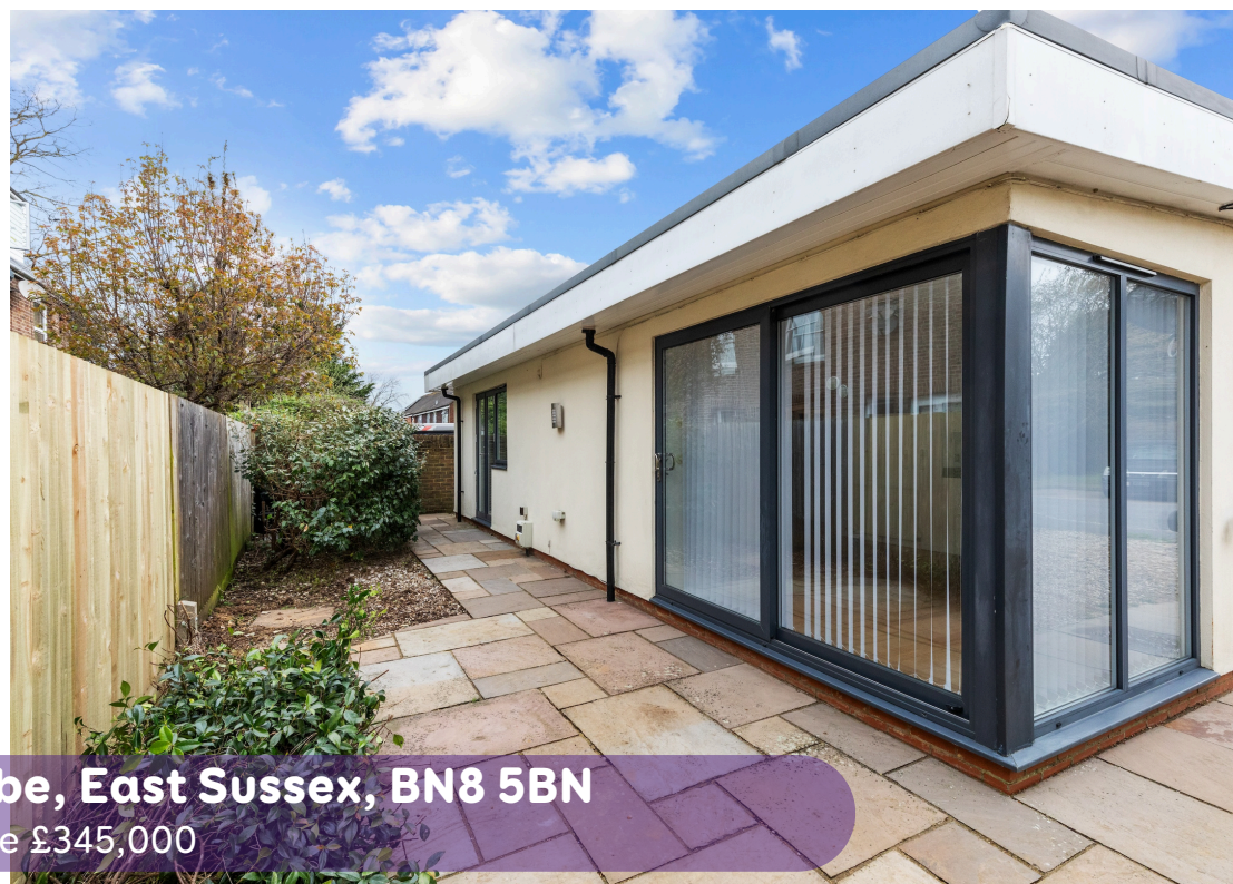
Sedum Cottage, Barcombe, East Sussex, BN8 5BN Asking Price £345,000