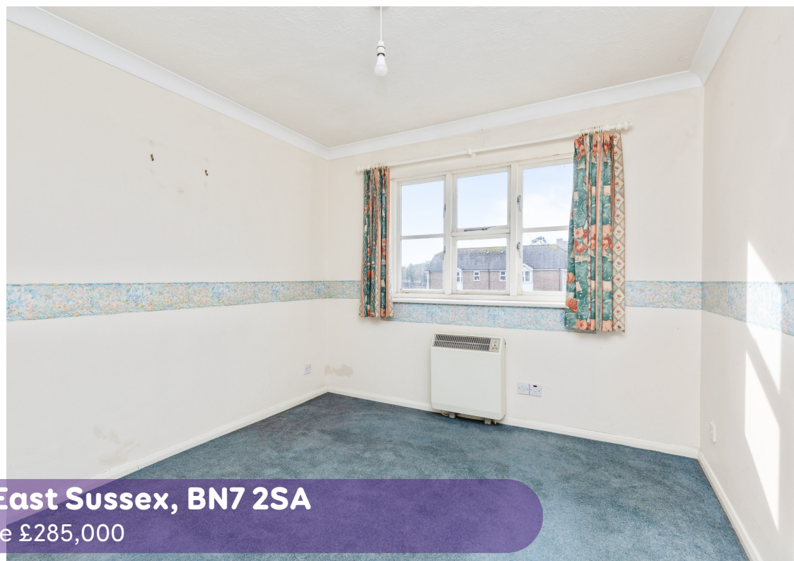
Court Road, Lewes, East Sussex, BN7 2SA Asking Price £285,000