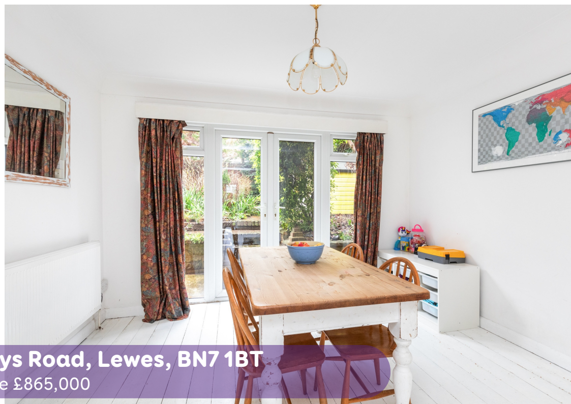
Hamsey View, King Henrys Road, Lewes, BN7 1BT Asking Price £865,000