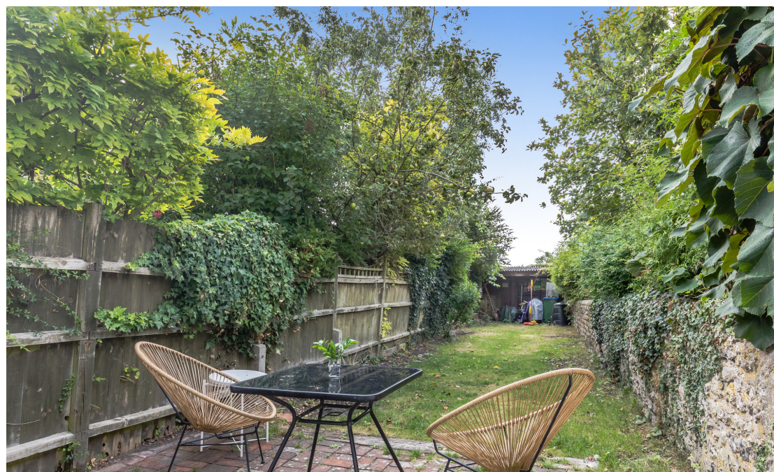
Priory Street, Lewes, East Sussex, BN7 1HH Asking Price £725,000