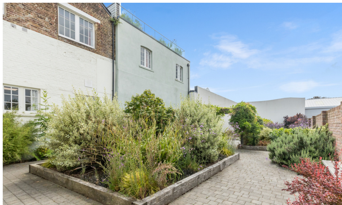
The Old Brewery, Lewes, East Sussex, BN7 2AZ Asking Price £345,000