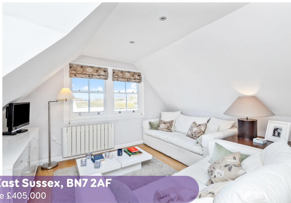
Dial House, Lewes, East Sussex, BN7 2AF Asking Price £405,000