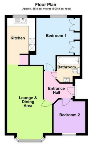
Total area: approx. 55.8 sq. metres (600.8 sq. feet)