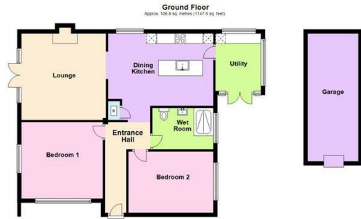
Total area: approx. 106.6 sq. metres (1147.5 sq. feet)

Nearby is the cosmopolitan village of Stockton Heath which offers a fashionable lifestyle including retail outlets, restaurants, bars, banks and building societies. For more comprehensive shopping needs the larger more commercial town of Warrington is readily accessible together with access to the M6/M56 motorway networks and subsequently to Manchester and Liverpool Airports. Further to the area are a range of local schools catering for all ages with highly regarded reputations.