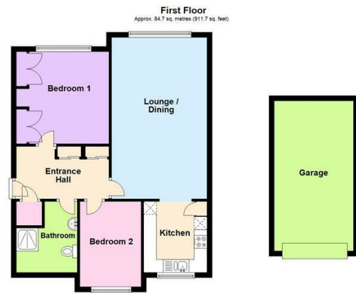
Total area: approx. 84.7 sq. metres (911.7 sq. feet)