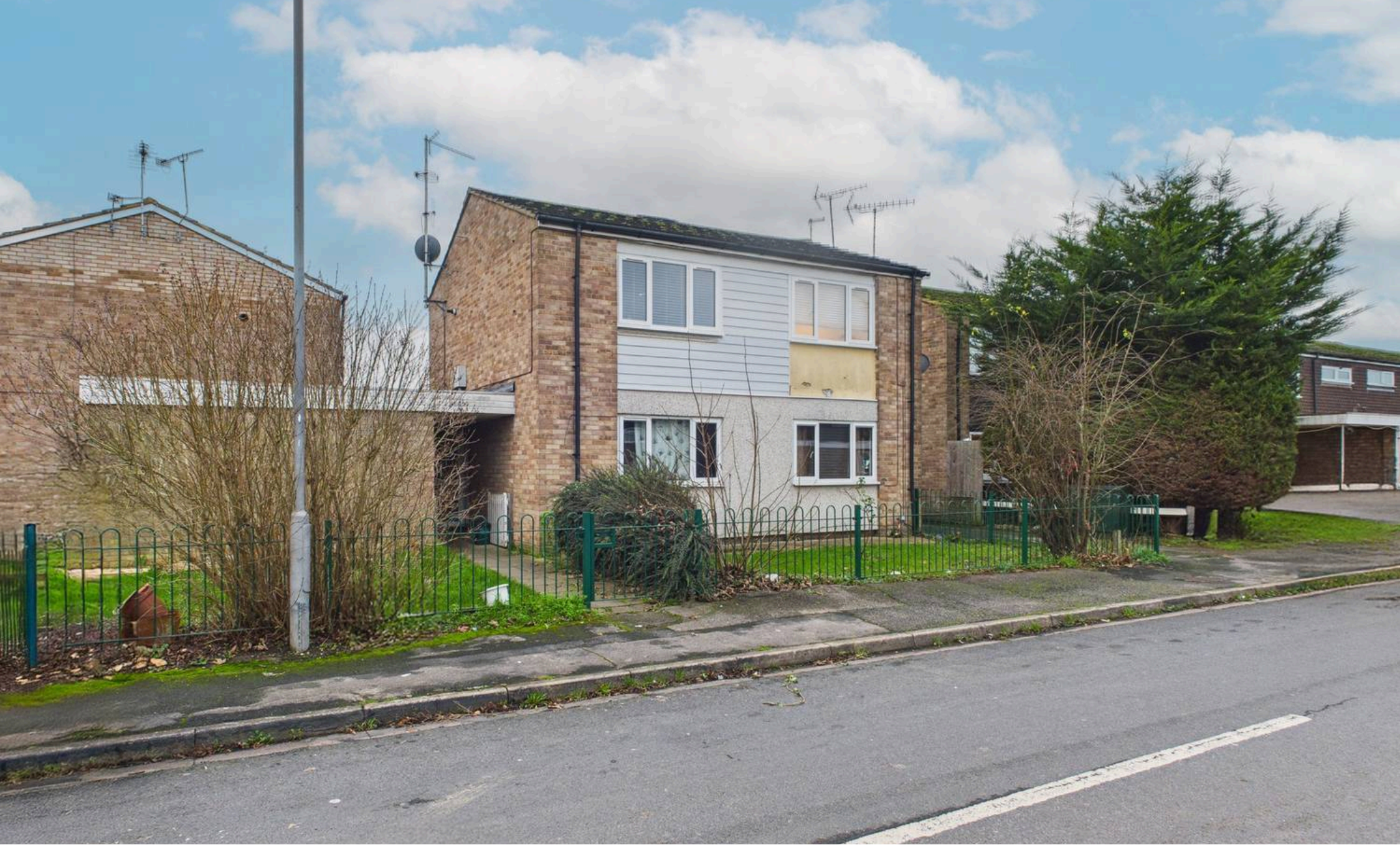
158 Fowler Road, Aylesbury £165,000