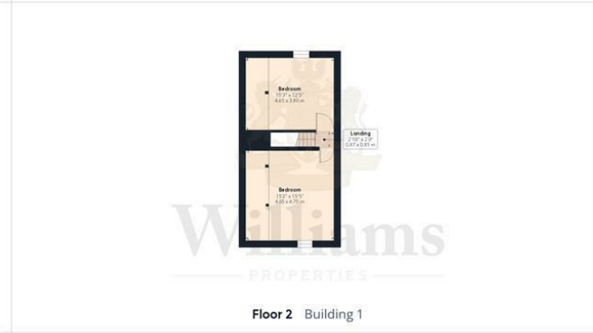
Floor 2 Building 1