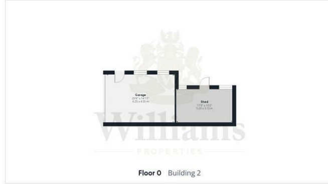
Floor 0 Building 2