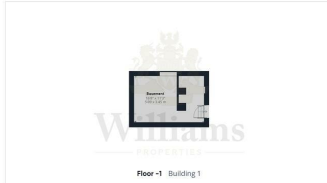
Floor -1 Building 1