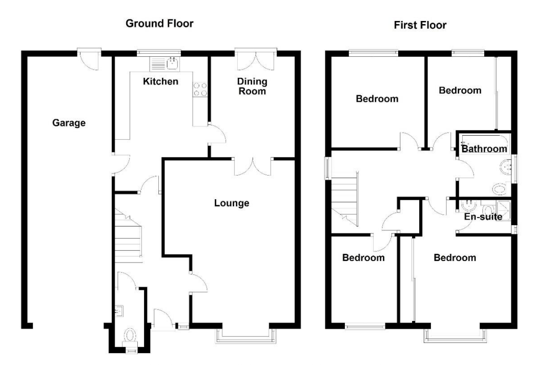
Total area: approx. 131.9 sq. metres (1419.3 sq. feet)