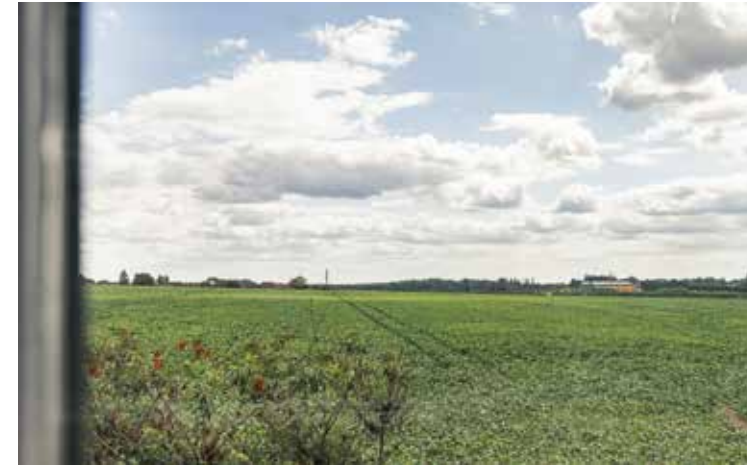
The home enjoys far-reaching field views

“...the sense of space and calm that comes with a rural edge-of-town position.”