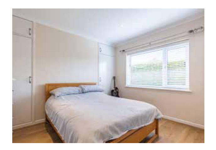
... this charming threebedroom detached bungalow exudes a sense of tranquillity...