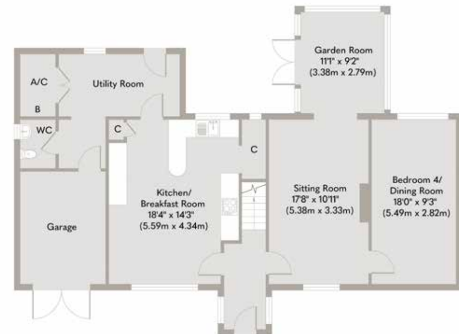
Ground Floor Approximate Floor Area 1,115 sq. ft (103.55 sq. m)

Whilst every attempt has been made to ensure the accuracy of the floor plan contained here, measurements of doors, windows, rooms and any other items are approximate and no responsibility is taken for any error, omission, or mis-statement. This plan is for illustrative purposes only and should be used as such by any prospective purchaser or tenant. The services, systems and appliances shown have not been tested and no guarantee as to their operability or efficiency can be given.