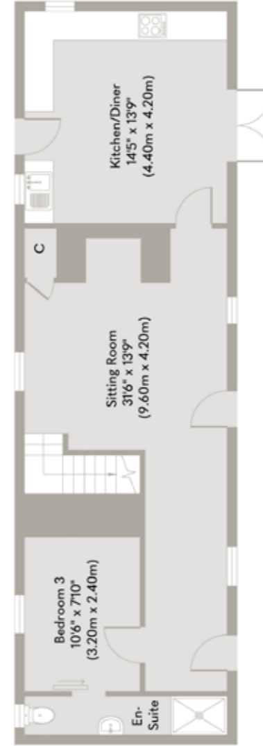
Ground Floor Approximate Floor Area 678 sq. ft (63.00 sq. m)