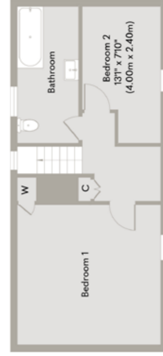
First Floor Approximate Floor Area 448 sq. ft (41.58 sq. m)

Whilst every attempt has been made to ensure the accuracy of the floor plan contained here, measurements of doors, windows, rooms and any other items are approximate and no responsibility is taken for any error, omission, or mis-statement. This plan is for illustrative purposes only and should be used as such by any prospective purchaser or tenant. The services, systems and appliances shown have not been tested and no guarantee as to their operability or efficiency can be given.