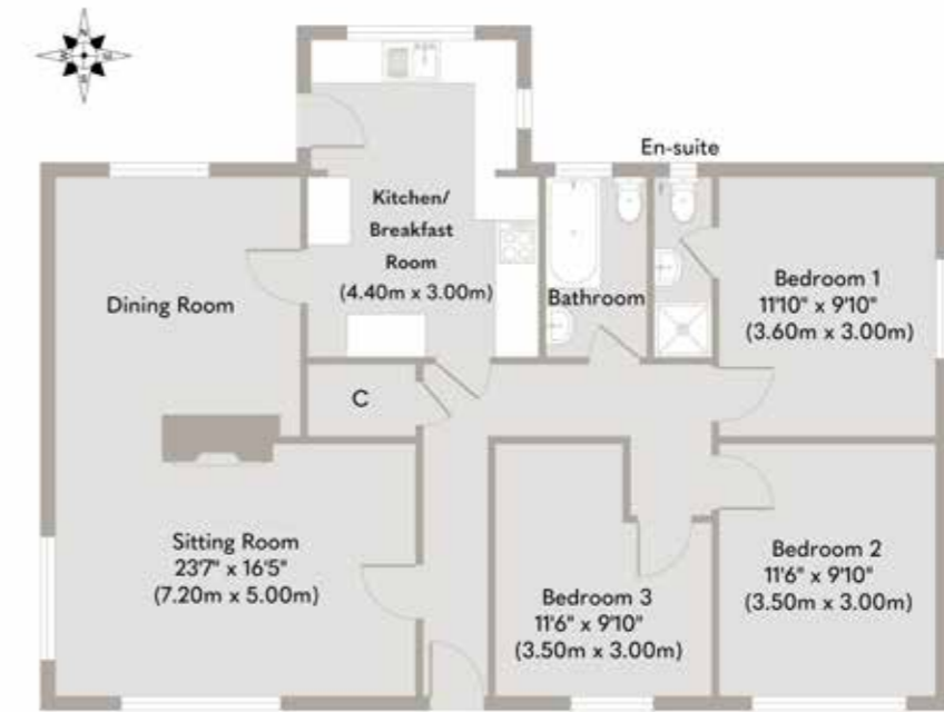
Ground Floor Approximate Floor Area 1004 sq. ft (93.26 sq. m)