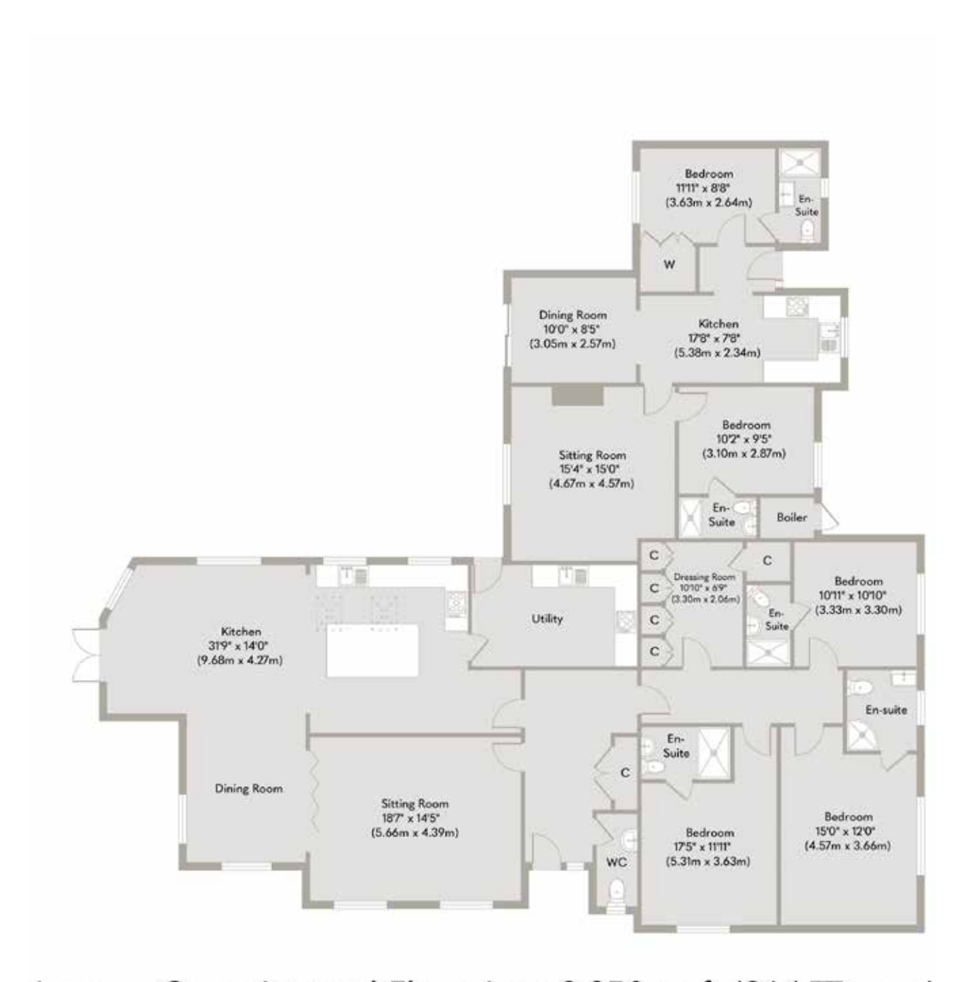
Approx. Gross Internal Floor Area 2,850 sq.ft (264.77 sq.m)

Whilst every attempt has been made to ensure the accuracy of the floor plan contained here, measurements of doors, windows, rooms and any other items are approximate and no responsibility is taken for any error, omission, or mis-statement. This plan is for illustrative purposes only and should be used as such by any prospective purchaser or tenant. The services, systems and appliances shown have not been tested and no guarantee as to their operability or efficiency can be given.