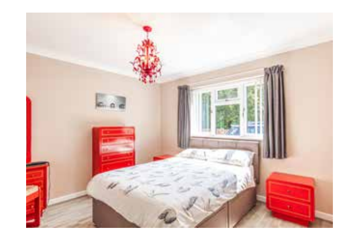
This has been a lovely and spacious family home.