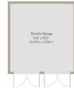
Outbuilding Approximate Floor Area 564 sq. ft (52.39 sq. m)