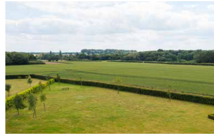
View to the rear of 5 Park Lane

“...some of the most sublime far-reaching views over the surrounding countryside.”