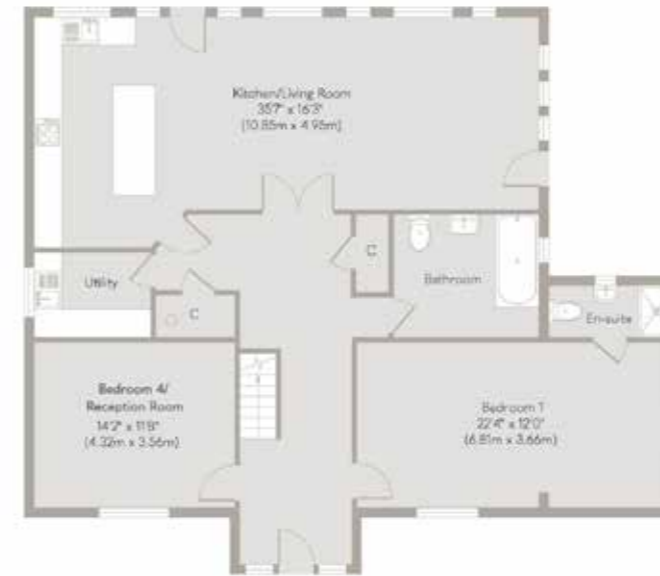
Ground Floor Approximate Floor Area 1'411 sq. ft (131.08 sq. m)

Whilst every attempt has been made to ensure the accuracy of the floor plan contained here, measurements of doors, windows, rooms and any other items are approximate and no responsibility is taken for any error, omission, or mis-statement. This plan is for illustrative purposes only and should be used as such by any prospective purchaser or tenant. The services, systems and appliances shown have not been tested and no guarantee as to their operability or efficiency can be given.