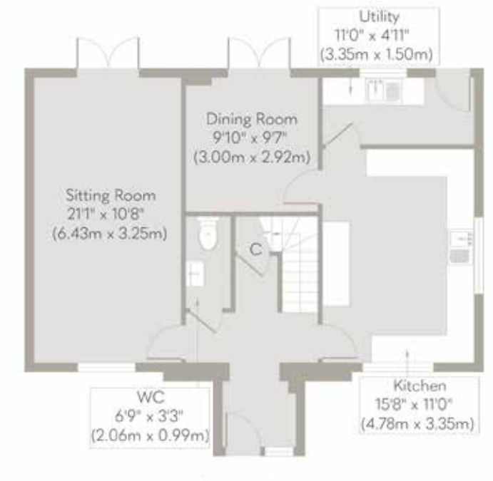
Ground Floor Approximate Floor Area 700 sq. ft (65.03 sq. m)

Whilst every attempt has been made to ensure the accuracy of the floor plan contained here, measurements of doors, windows, rooms and any other items are approximate and no responsibility is taken for any error, omission, or mis-statement. This plan is for illustrative purposes only and should be used as such by any prospective purchaser or tenant. The services, systems and appliances shown have not been tested and no guarantee as to their operability or efficiency can be given.