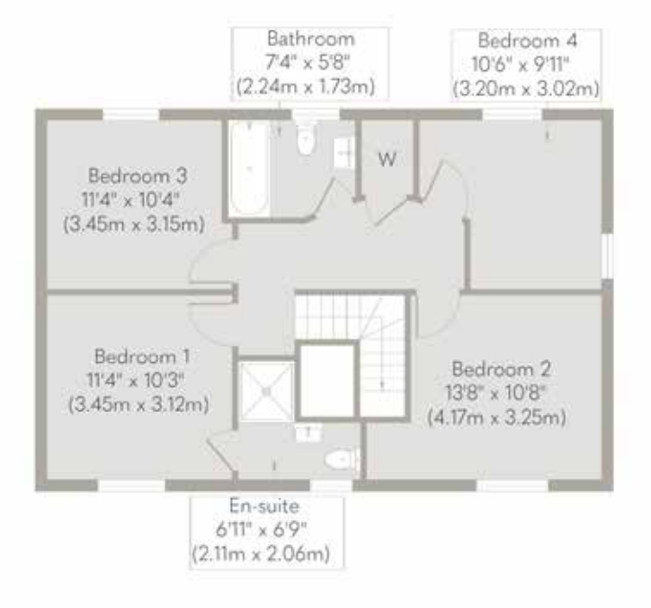
First Floor Approximate Floor Area 668 sq. ft (62.05 sq. m)