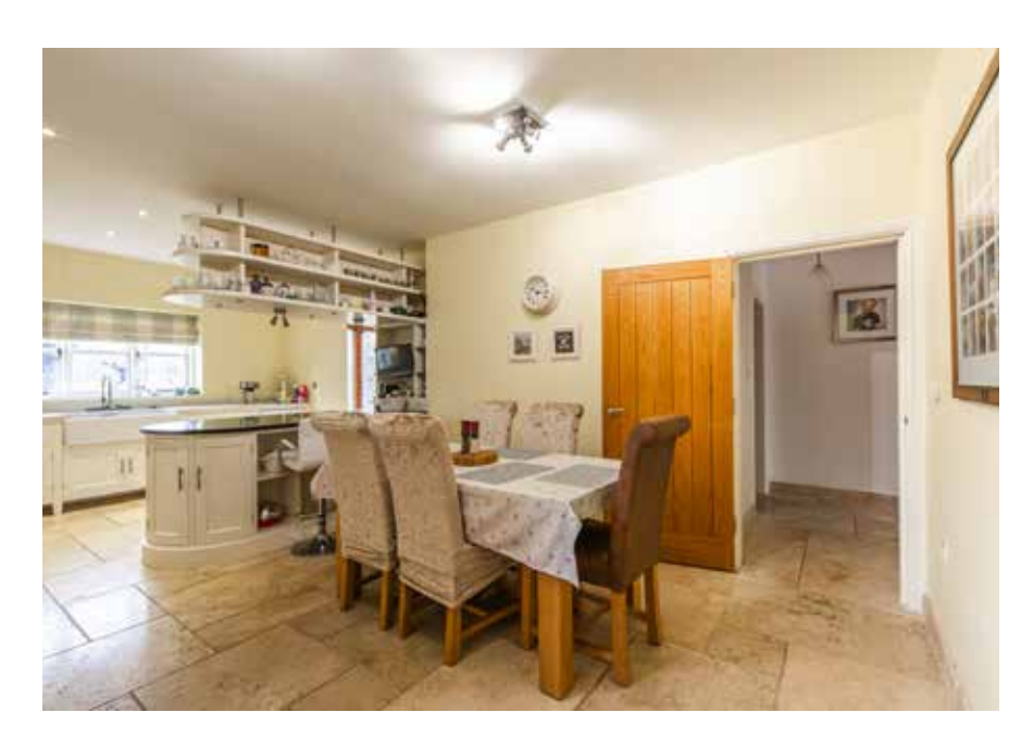
"The kitchen is a sociable and inviting space."