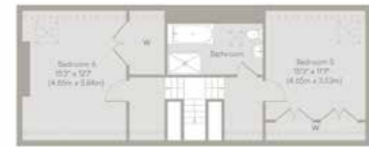
Second Floor Approximate Floor Area 142 sq ft (13.04 sq m)