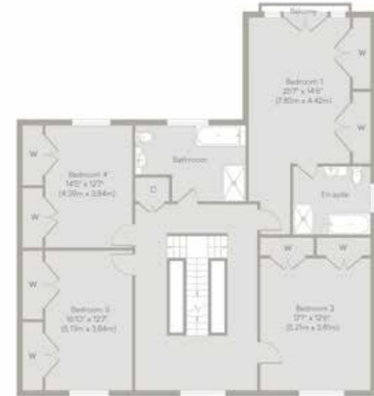
First Floor Approximate Floor Area 1,459 sq ft (135.34 sq m)