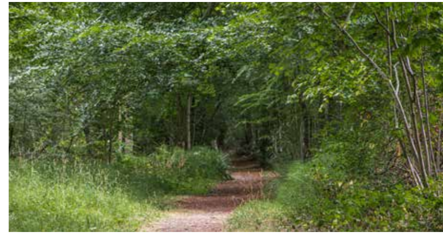
Woodland near Honingham

“The property is perfectly placed to explore the surrounding countryside.”