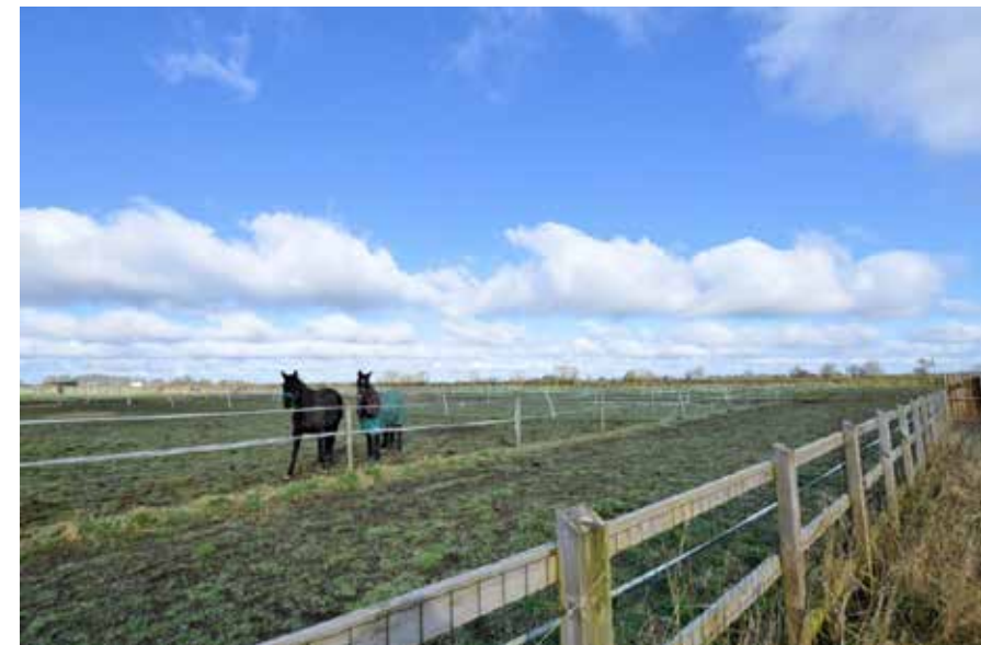
View to the rear of the plot