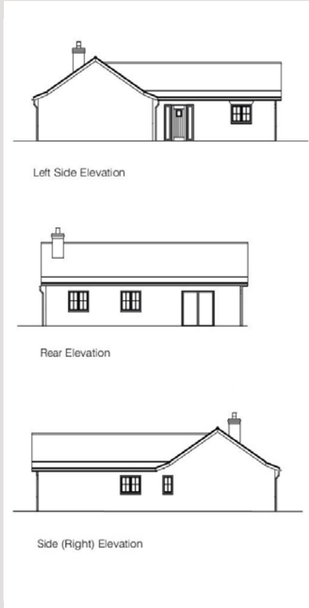
Left Side Elevation