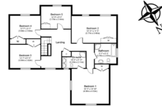
First Floor Approximate Floor Area 1,285 sq. ft. (119.4 sq.m.)