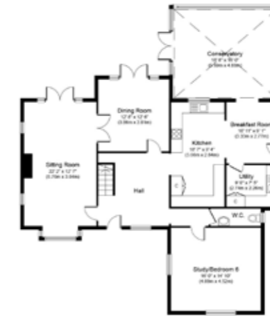
Ground Floor Approximate Floor Area 1,610 sq. ft. (149.5sq. m.)