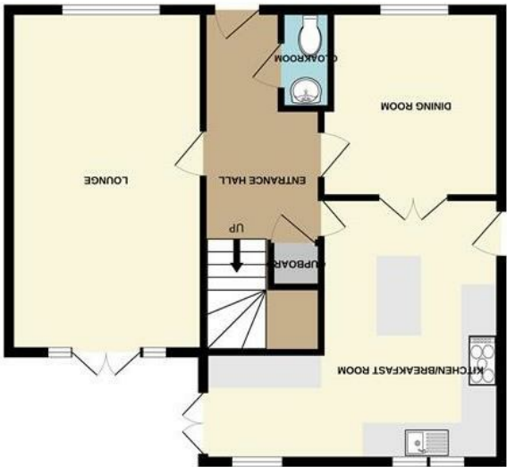
GROUND FLOOR 680 sq.ft. (63.2 sq.m.) approx.

We have carefully prepared these particulars to provide you with a fair and reliable description of the property. However, these details and anything we've said about the property, are not part of an offer of contract, and we can't guarantee their accuracy. All measurements given are approximate and our floorplans are provided as a general guide to room layout and design. Items shown in photographs are NOT included in the sale unless specifically mentioned, however they may be available by separate negotiation. We haven't tested any of the services, appliances, equipment, fixtures or fittings listed, stated they are offered on an 'as seen' basis. We recommend you carry out your own independent checks to satisfy yourself as to their working order and condition, prior to exchange of contracts. Please also be aware that if services have been switched off/disconnected/draind down, reconnection charges may apply. If you wish to express an interest in this property or make a formal offer, you need to come through us for all negotiations. Intending purchasers will be asked to provide proof of their ability to fund the purchase and identification to comply with money laundering regulations and we ask for your co-operation in order to avoid delay in agreeing the sale.