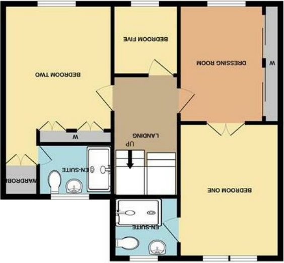
1ST FLOOR 680 sq.ft. (63.2 sq.m.) approx.