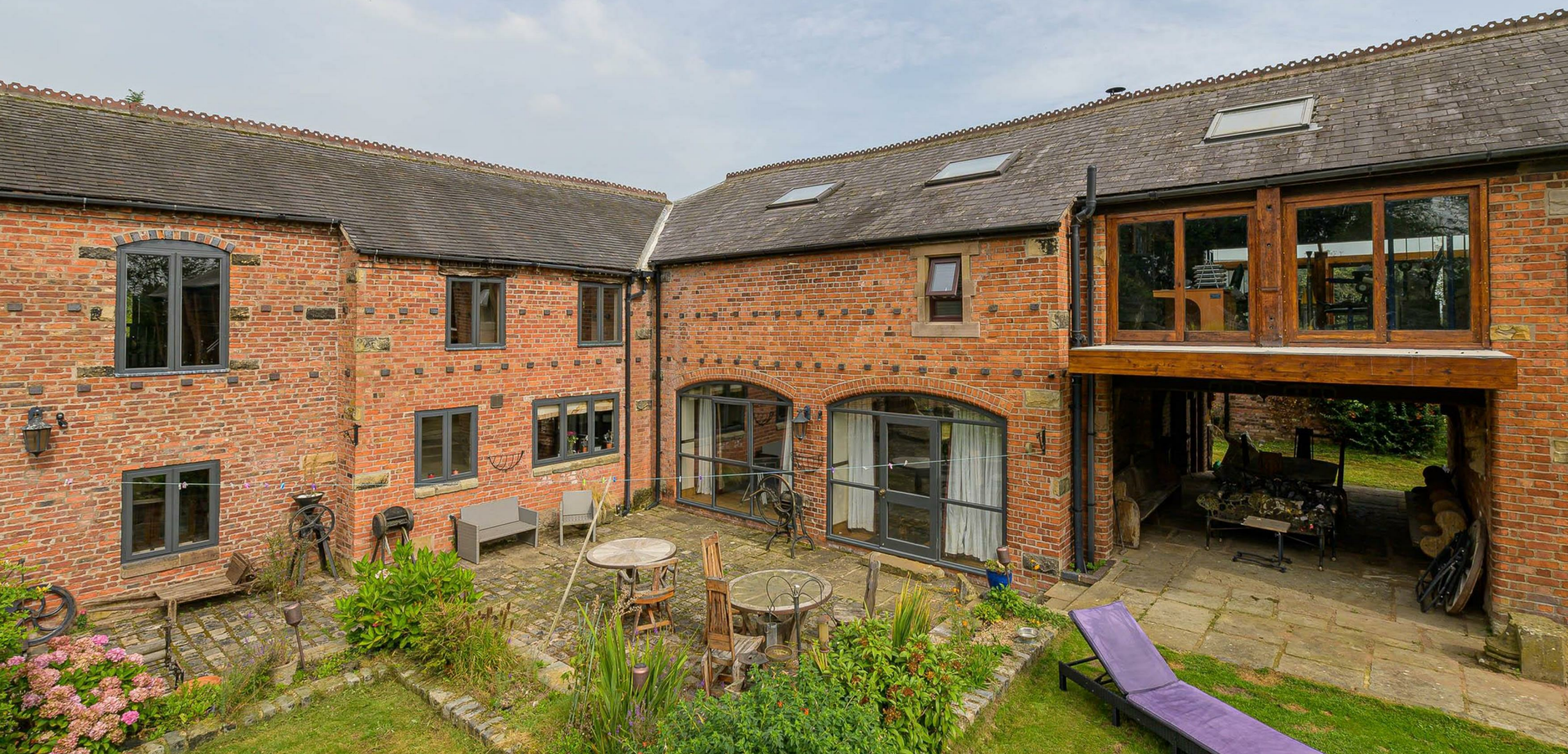
Oak Bank Barn, & Apartments Heatley Lane, Broomhall, Nantwich, Guide Price £1,095,000