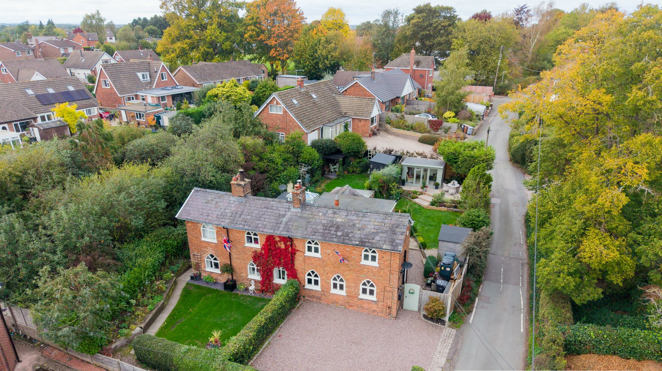
Hen Cottage, 19 Heathfield Road, Audlem, Crewe, CW3 0HH Guide Price £400,000