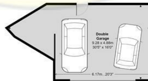
Double Garage 1 Floor Area: 36.4 m 2 ... 392 ft 2