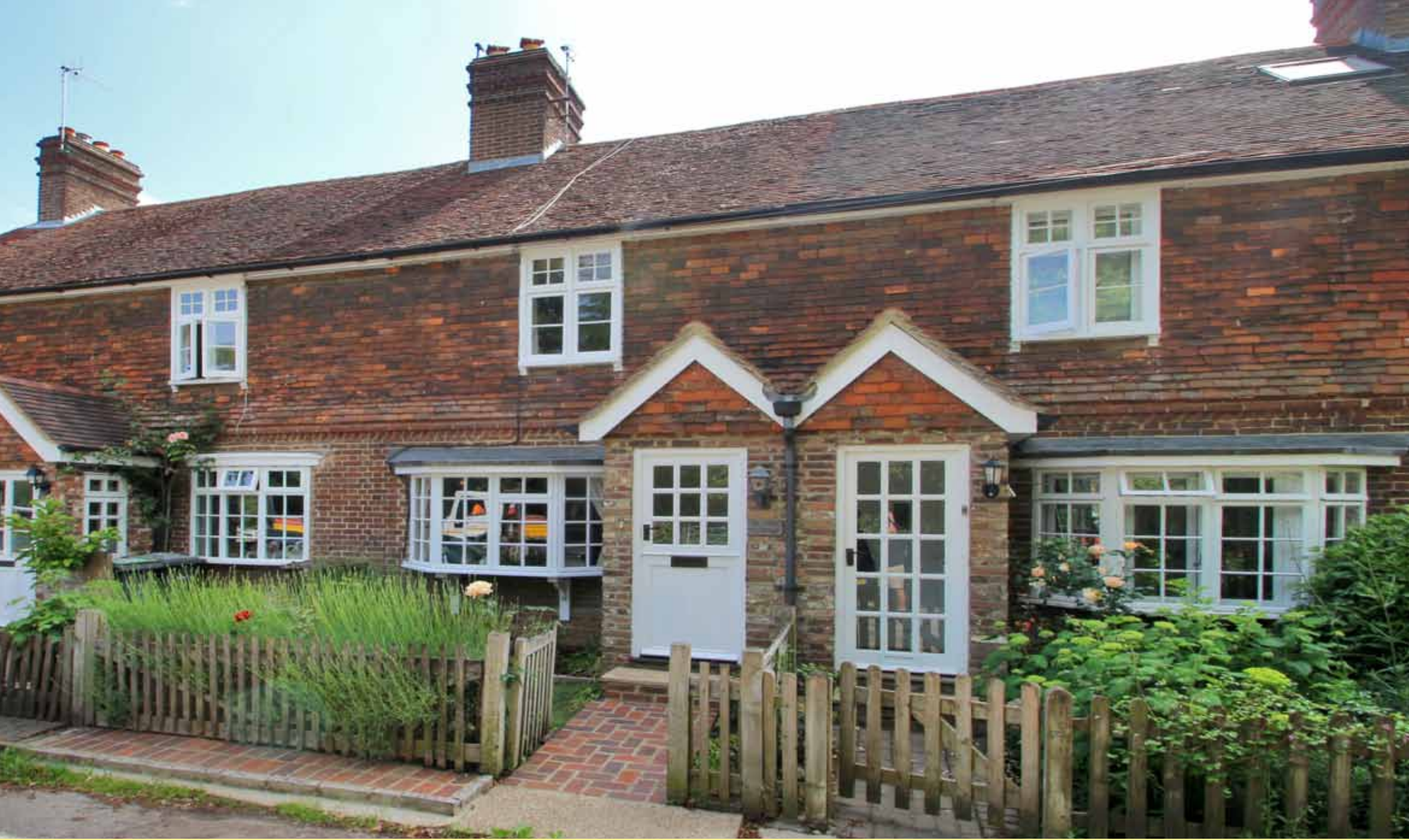
Rowan Cottage, Lower Haysden, Tonbridge, Kent, TN11 9BD Price Guide: $485,000 Freehold